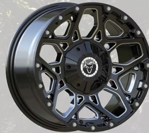
Sahara Gloss Black / Polished 8.5x17" 9x20"