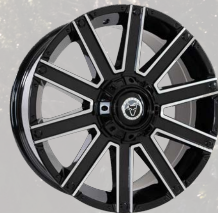
Kalahari Gloss Black / Polished 9x20"