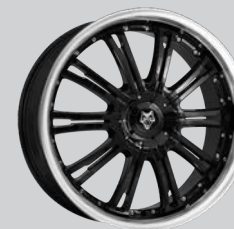
Vermont Gloss Black / Polished Lip 8.5x20" 9.5x22" et 20 - 50