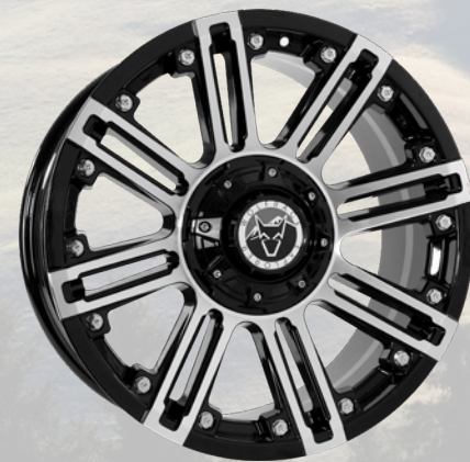
Amazon Gloss Black / Polished 9x18" 9x20"