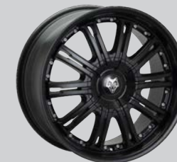
Vermont Matt Black 8.5x20" 9.5x22" et 20 - 50