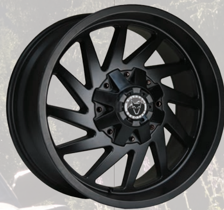
Wildtrek Matt Black 9.0x20"