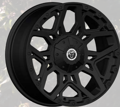
Sahara Matt Black 8.5x17" 9x20"