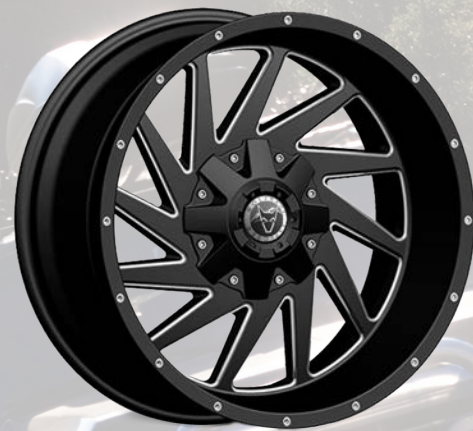
Wildtrek Gloss Black / Polished Windows / Milled Rim Holes 9.0x20"