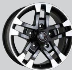
Assassin FTR Gloss Black / Polished Tips 8.0x18" Land Rover Only