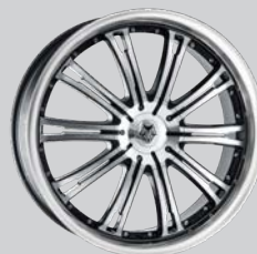
Vermont Gloss Black / Polished Face & Lip 8.5x20" 9.5x22" et 20 - 50