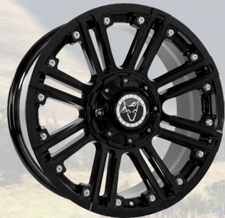
Amazon Gloss Black / Chrome Rivets 9x20"