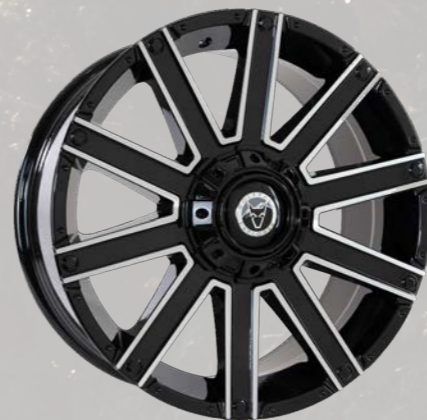
Kalahari Gloss Black / Polished 9x20"