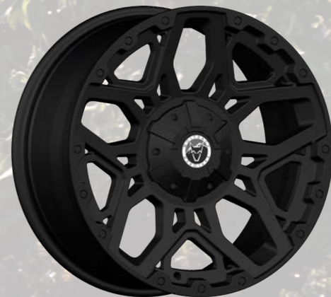
Sahara Matt Black 8.5x17" 9x20"