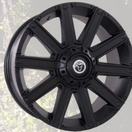
Kalahari Matt Black 9x20"