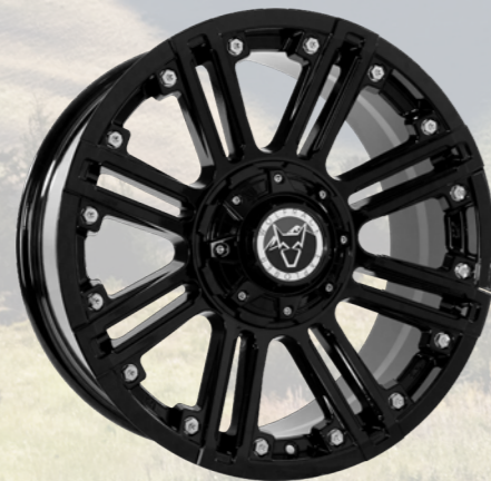
Amazon Gloss Black / Chrome Rivets 9x20"