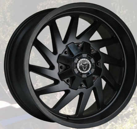
Wildtrek Matt Black 9.0x20"