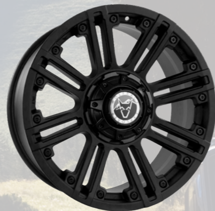
Amazon Matt Black / Black Rivets 9x18" 9x20"