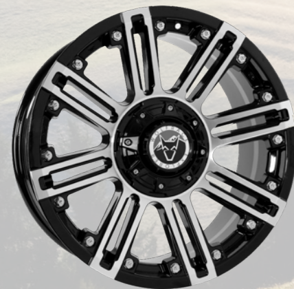
Amazon Gloss Black / Polished 9x18" 9x20"