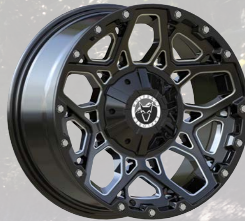
Sahara Gloss Black / Polished 8.5x17" 9x20"