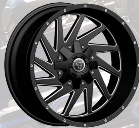
Wildtrek Gloss Black / Polished Windows / Milled Rim Holes 9.0x20"